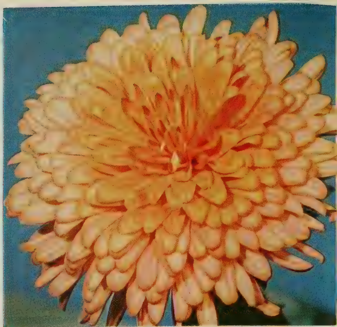
BEACON. 60c each; 3 for $1.50

8 BOUQUET Mums A gorgeous selection of long-stemmed kinds for cutting. 8 Sure-to-Bloom Plants $4.50 (1 of each pictured)